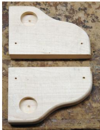
fig. T (inside)

The knife blade guard needs to be made next. Cut the knife blade guard to the finished dimension. Using the 1/4" radius round over bit, rout both sides of the bottom edge. Drill and countersink the two mounting hole locations for the knife blade guard as marked on the towel bar end template. The countersink is on the outside face. The leg will cover these screws when the towel bar is mounted onto the roll around cart (see fig. U).