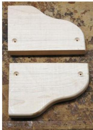
fig. U (outside)

To assemble the towel bar assembly, center the knife blade guard on the two mounting hole locations and keep the top edge flush with the top of the towel bar ends. ( There should be approximately a 9/16" gap from the back of the knife blade guard to the back edge of the towel bar end. This is to allow the knife blades to drop through cart top and be stored between the upper drawer section and knife blade guard ). Screw one end in place, then place the towel bar dowel into the hole on the towel bar end. Place the other end of the towel bar dowel into the second towel bar end and align the second towel bar end with the knife blade guard. Screw the towel bar end to the knife blade guard, trapping the towel bar dowel in between the towel bar ends.