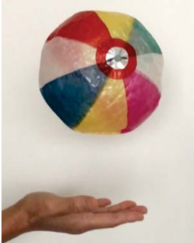
FIGURE 1. BOUNCING A KAMIFUSEN. The balloon's hole is visible in the silver patch where the tapered ends of the different-colored wedge-shaped paper converge.

Kamifusen became popular in the early 1890s, but their origin is not clear. They used to be widely available at neighborhood snack shops called dagashiya (馱菓子屋) that sold inexpensive treats and toys for children. Nowadays such stores have become few and far between, but kamifusen can still be found as folk