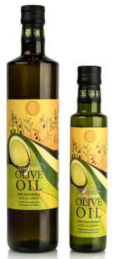
Olive Oil from Sindyanna

Sindyanna's olive oil is award-winning, organic and delicious. You can support their peace building efforts by purchasing their oil and soaps.