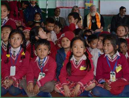
School children in the food program

Following the devastating earthquakes in Nepal in spring 2015, Serrv has continued to respond to the needs of artisans and their families.