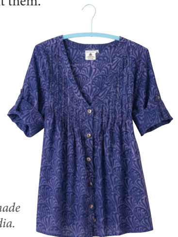
Our new Favorite Tunic in Amethyst, handmade by artisans of MarketPlace: Handwork of India.

We are proud to continue another year of collaboration with MarketPlace: Handwork of India with new tunics and dresses in our spring catalog. We are proud not only because of the beautiful new designs, but because we know that the women who make them are leading better lives and impacting their communities.