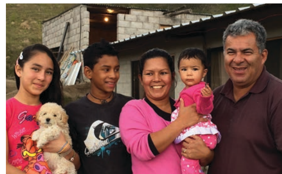
Artisans pictured are from Bangladesh, Kenya, and Ecuador.