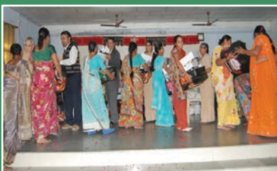
Artisans receive bonuses as part of their work in fair trade.

"We the St. Mary's family are very grateful to [our partners] for the constant support, guidance, and the help that we receive. It is because of your cooperation and hard work that our women get employment and empowerment."