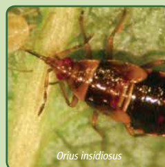
Minute Pirate Bugs