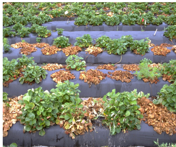
Plant mortality due to charcoal rot