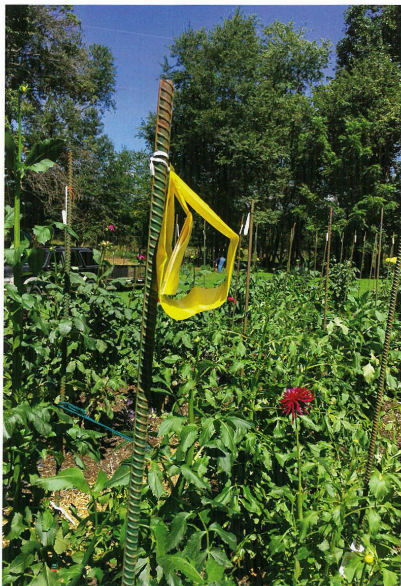
Cucumber beetle lure and sticky trap