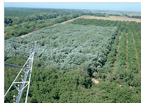
Aerial application of SURROUND

2022-01-04T-Surround-PI-KaolinStewardshipUpdate