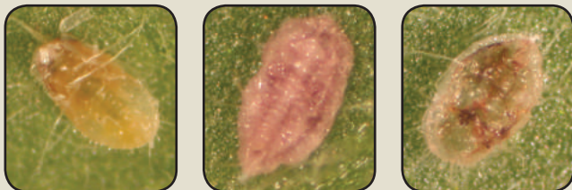
Treated whitefly nymphs