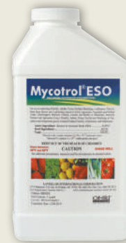
Sizes: 1pt, and 1gal.

Mycotrol's mode of action is unlike any conventional insecticide. The applied spores infect directly through the outside of the insect's cuticle (the skin). Spores adhering to the host will germinate and produce enzymes that attack and dissolve the cuticle, allowing it to penetrate the skin and grow into the insect's body. As the insect dies, it will change color to pink or brown, and eventually the entire body cavity is filled with fungal mass. The most common visible indication of insect death is a discoloration of the larvae or pupae. It is not necessary for a white fungal growth to occur to know the product is working; the insect is killed before this happens.