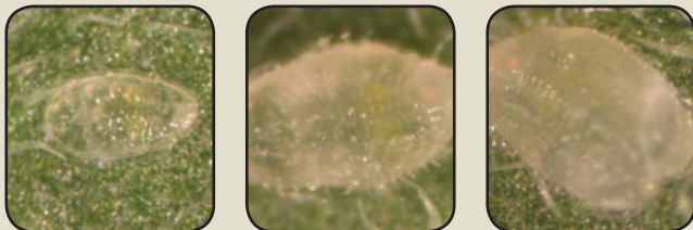
Untreated whitefly nymphs