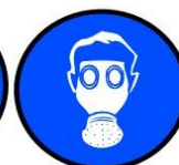
Particle Mask / Respirator