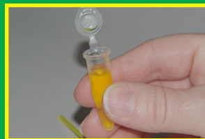
Open Lure Cap