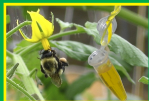
Hang Lure In Plants

EASY INSTRUCTIONS (Do not touch the lure, use gloves). Open the pouch, remove the lure. Open the top and attach twist tie to the Lure. Attach Lure to any tree or plant in your garden. Hang one lure per 200 square feet at the start of bloom. Replace lures every 2 to 3 weeks.